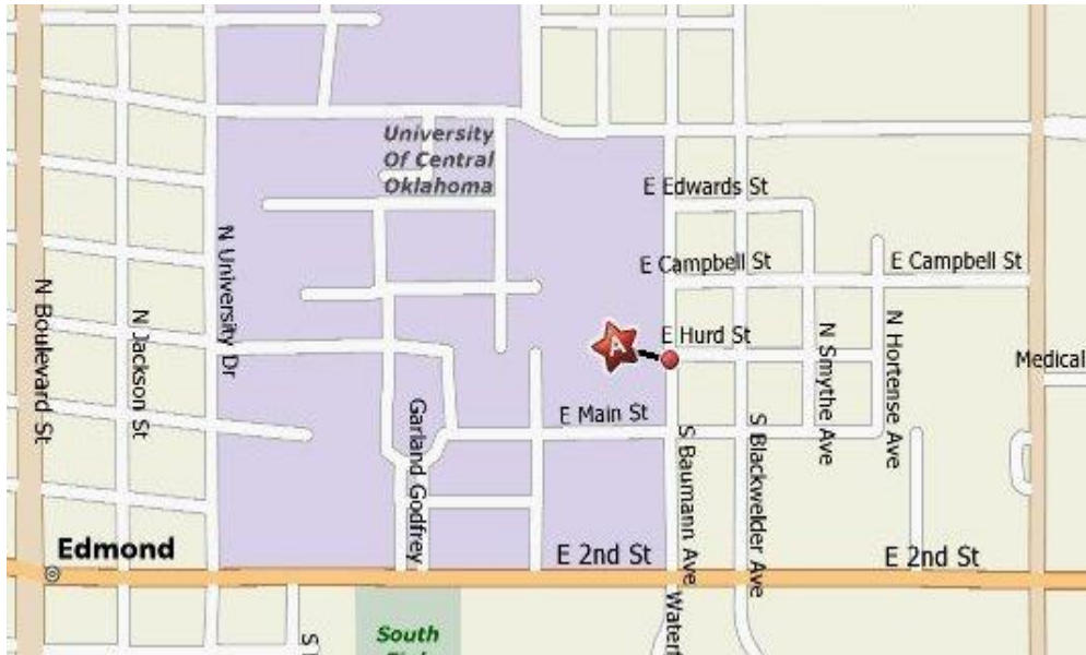
University Of Central Oklahoma. Pegasus Theater in the Liberal Arts Bldg 1 st Floor On UCO Campus at N Baumann & E Ayer